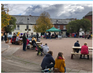
CODS on the Square