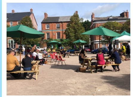
Socially distanced comedy in the square

While the withdrawal of the tables for storage during the winter months will disappoint a number of people, the idea is that the hospitality will be most appreciated during the warmer months, and it would be too much to expect volunteers to keep up their daily maintenance all year round. Keeping the tables clean and sanitised, re-locating them for farmers' markets, and attaching and removing parasols are among the tasks required. (Along the way some minor problems needed attention, such